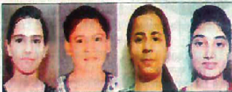
देवकी देवी जैन कालेज की मेधावी छात्राएं।