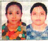
देवकी देवी जैन कालेज की मेधावी छात्राएँ।