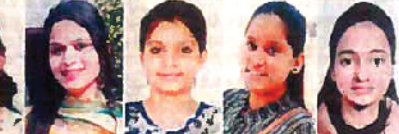
यूनिवर्सिटी में अक्ल आने वाली देवकी देवी जैन कालेज की छात्राएँ।