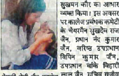
देवकी देवी जैन कालेज में एच.डी. मेकअप वर्कशॉप में छात्राओं की छवि।