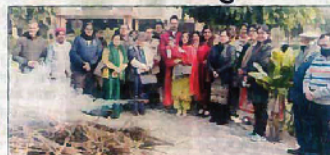
देवकी देवी जैन मेमोरियल कालेज फॉर वुमन में 'प्रीत दी लोहड़ी' कार्यक्रम में छात्राओं की छवि।